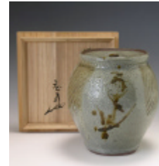
Water Jar by Shoji Hamada

First, congratulations on a consistently high quality publication.