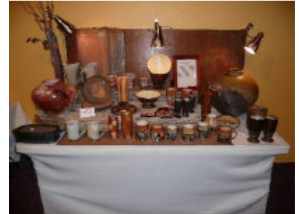
Logan Wanamaker's Display

More than 60 NMPCA members have participated.