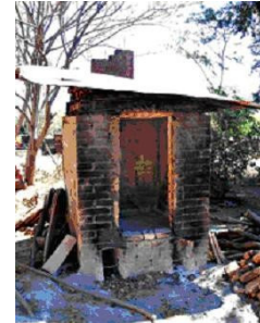
A Mani kiln.

PFP contracts professional designers for both long- and short-term work in the communities in order to refine existing products and develop new ones in order to maximize their marketability.